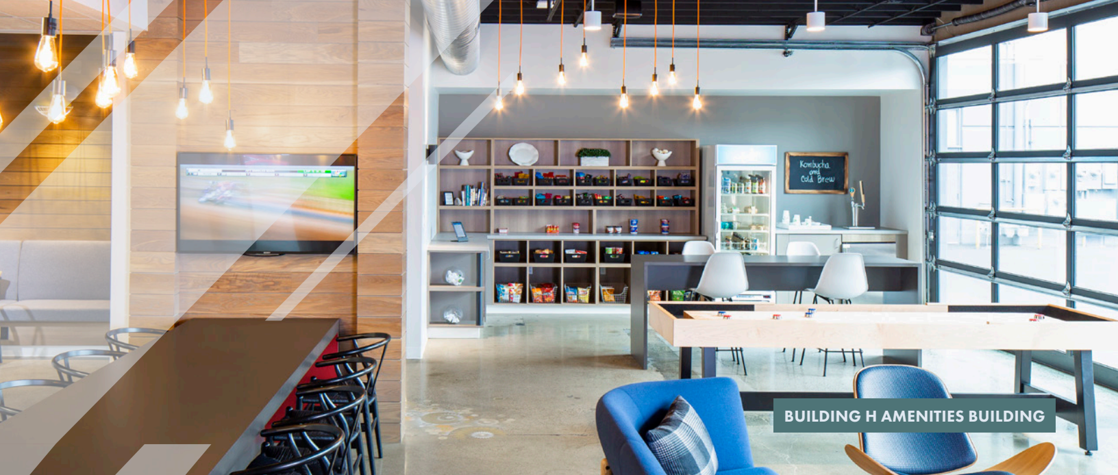
BUILDING H AMENITIES BUILDING